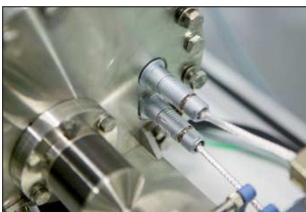
Vacuum-compatible housing lead-throughs